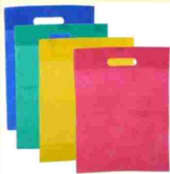
Non- woven Bags.