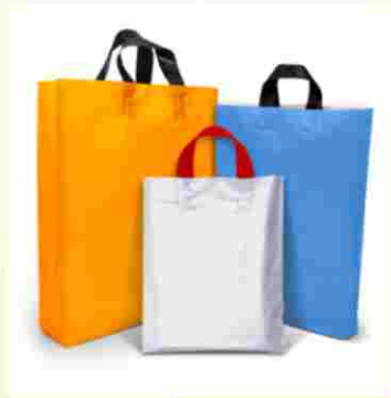
Plastic Bag or Non- woven Shopping Bags