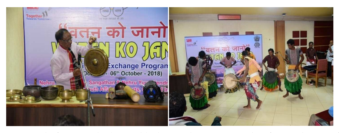
A total of 108 Youths (108 male) along with 12 Team Leaders from 6 districts of Kashmir Valley participated in the programme.