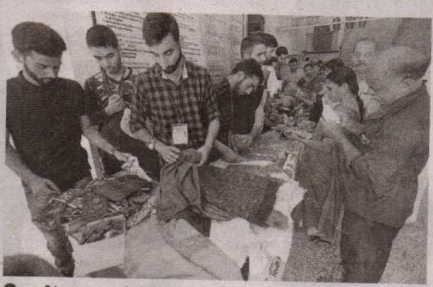
O കശ്മിർ യുവജനവിനിമയപരിപാടിയുടെ ഭാഗമായി കോഴിക്കോട്ടെ ത്തിയ കശ്മിരി വിദ്യാർഥിക്ക് തങ്ങളുടെ ഉത്പന്നങ്ങൾ പ്രദർശനത്തി