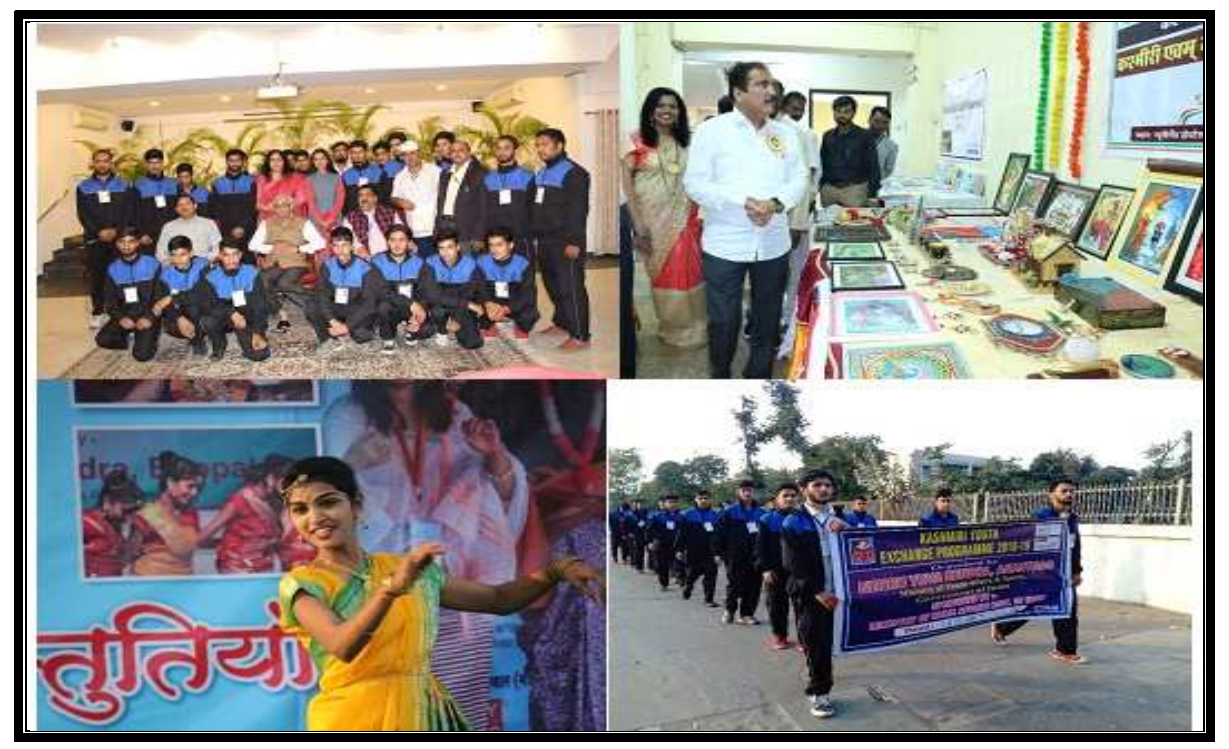
Arise, Awake, and Stop not till the Goal is reached -Swami Vivekananda

Organised by:-Nehru Yuva Kendra Sangathan (Ministry of Youth Affairs and Sports, Govt. of India) In collaboration with Ministry of Home Affairs, Govt. of India