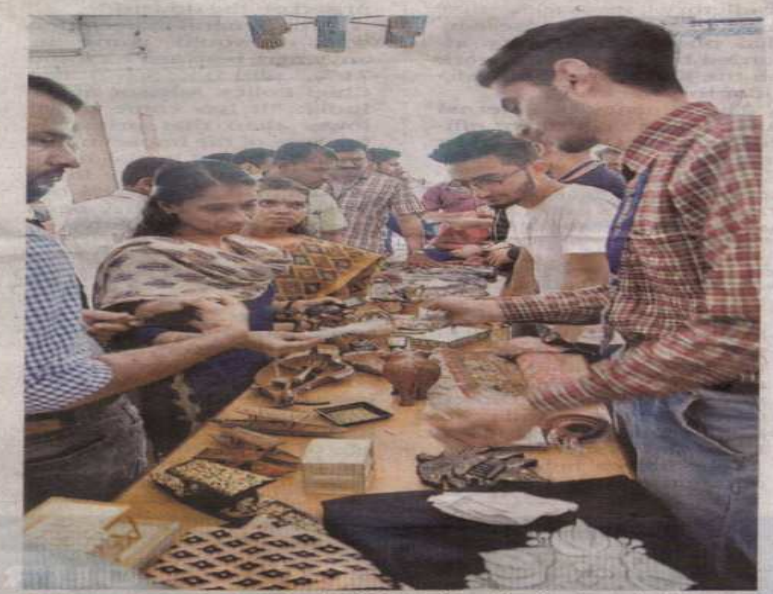
Bridging boundaries: Kashmiri handicrafts displayed at the collectorate by members of a delegation from Kashmir as part of the youth exchange programme.

plored. He asked the youngsters to be ambassadors of their State and patiate develop-