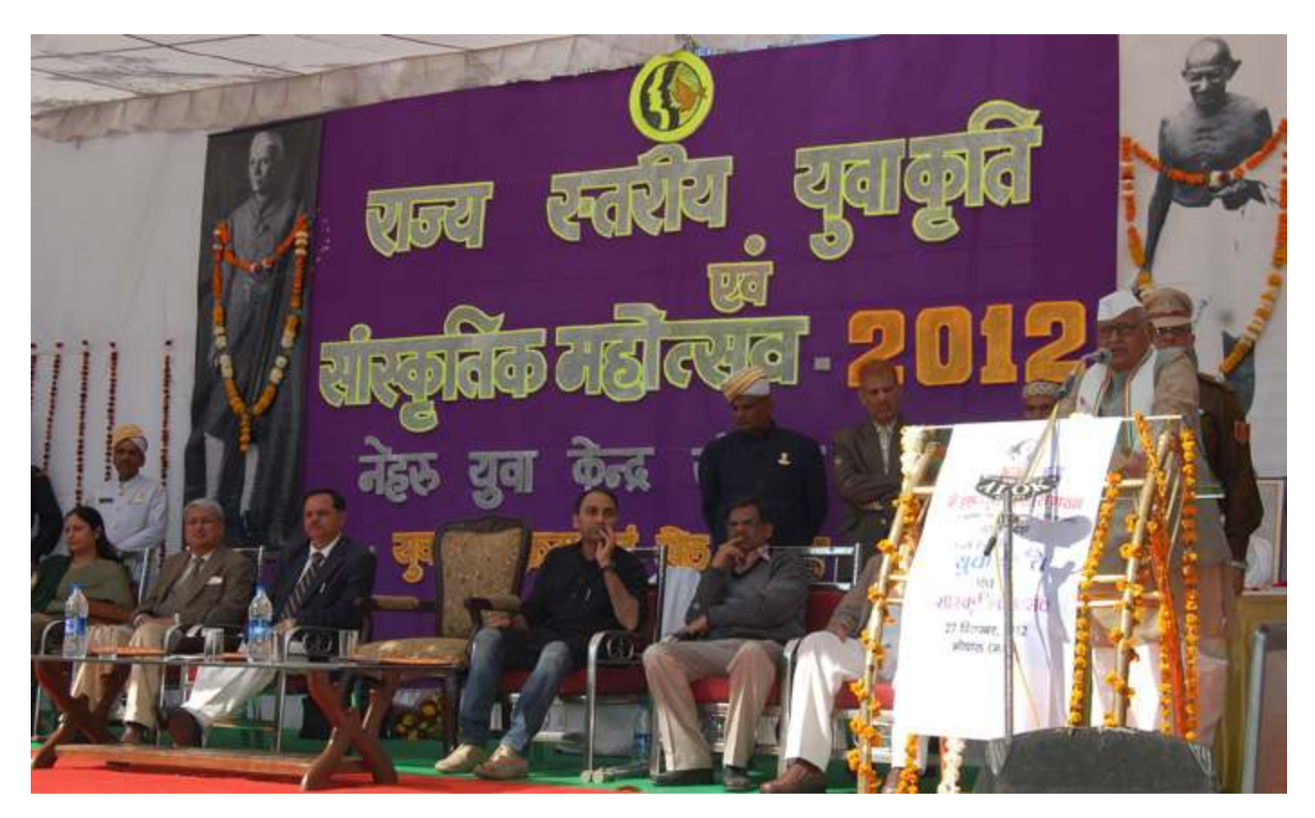
1. State Youth Festival (State Youth Convention (SUVICHAR), State Yuva Kriti and Cultural Programme, distribution of State Youth Club Award)

The objective of the programme was to build image of NYKs and its programme, showcase the local talent and preserve/ promote arts, crafts, traditions and