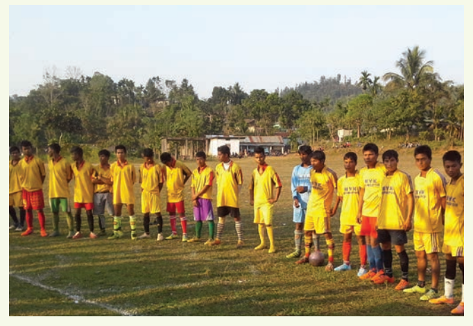
respectively. Duration of each Meet was of three days or as per the need of the events. Achievements under this Programme are as follows:

The programme is aimed at popularizing and encouraging rural sports and games among Youth Clubs established by NYKS. Another objective of the programme was to make sports activities as a natural process and way of life in rural India and also to provide opportunities to youth to exhibit their talent. Sports events were selected by District NYKs as per sports infrastructure and play fields available in a particular block. Rs. 15,000/- and Rs. 25,000/- were provided for organizing each cluster and district level Inter Youth Club Sports Meets,