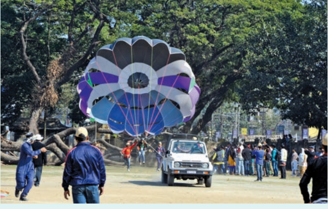
Nehru Yuva Sandesh

A daily newsletter was published highlighting the day's events and activities.