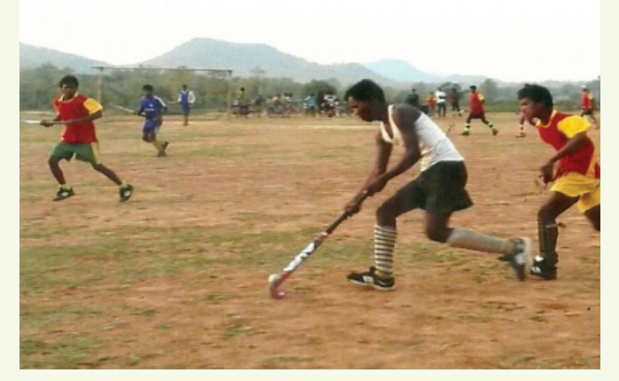
2,000/- was made for promotion of sports and games in the villages. Achievements under this Programme are as follows:

The programme is aimed at development of sports culture among the rural youth. Assistance is provided to the Youth Clubs for purchase of basic sports materials for sports activities to be undertaken on a regular basis. For providing sports kits to Youth Clubs, a budgetary provision of Rs.