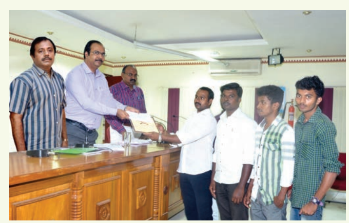
Rs.3,00,000/- and Rs.2,00,000/- . The Youth Clubs utilize the award money in community development projects/ programmes. Achievements under this Programme are as follows:

training, creation of durable community assets in villages, national integration, sports, culture, health and family welfare, environment enrichment, self-employment, women empowerment, eradication of social evils, community development, etc. Awards were conferred at the District level, the winners were awarded a sum of Rs.25,000/- and at the State level the award was of Rs.1,00,000/- and at the National level, three awards of Rs.5,00,000/,