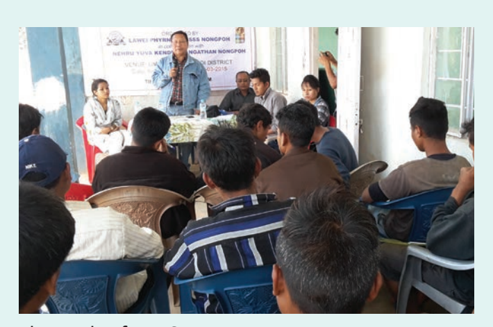
The goals of NYKS are:

The Nehru Yuva Kendra were established in 1972 with the objective of providing the non-student rural youth with the opportunity to grow and achieve goals, The organization and mobilization of the youth for developmental work in the villages, with emphasis on Value, Vision and Voluntary action.