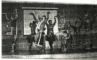
सांस्कृतिक कार्यक्रम पेश करते युवा।

हिसार, 28 मार्च (स.ह.): गृह मंत्रालय एवं युवा कार्यक्रम व खेल मंत्रालय भारत सरकार के संयुक्त तत्वावधान में नेहरू युवा केंद्र की ओर से जारी उत्तरी-पूर्वी युवा आदान-प्रदान कार्यक्रम के तहत बुधवार को युवाओं को विभिन्न स्थानों का भ्रमण कराया गया। इस दौरान आमंत्रित युवाओं ने