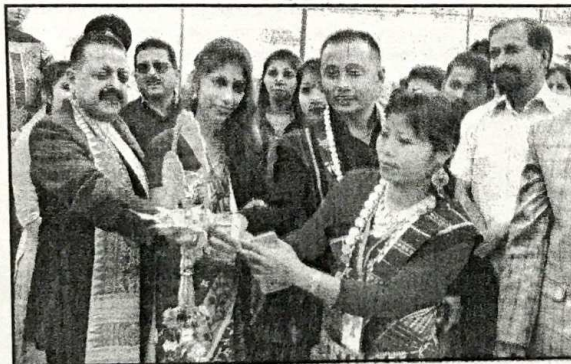
Union Minister, Dr Jitendra Singh lighting a lamp at North East Youth Exchange Programme at Jammu on Sunday.