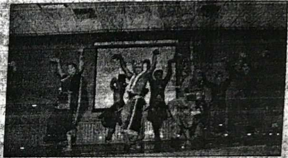
मिरसा रोड स्थित टीटीसी में कार्यक्रम प्रस्तुत करते कलाकार।