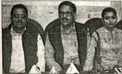
नार्थ ईस्ट कल्चर एक्सचेंज प्रोग्राम की जानकारी देते नेहरू युवा केंद्र के पदाधिकारी।