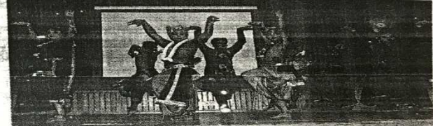
जीजेयू में उत्तर पूर्वी राज्यों से आए छात्र अपनी संस्कृति कला का पर्वर्शन करते हुए।