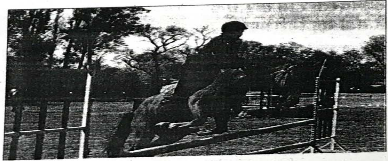
घुड़सवारी करता युवा।

इस मौके पर संबोधित करते हुए कर्नल नेहरा ने कहा कि युवा वर्ग का राष्ट्रीय एकता में अहम योगदान है। युवाओं को देश व समाजहित के कार्यों में बढ़-चढ़कर भाग लेना चाहिए। उन्होंने कहा कि घुड़सवारी में हिसार का विशेष नाम है। यहां के कैंडेट राष्ट्रीय अंतर राष्ट्रीय स्तर पर शहर का नाम रोशन कर रहे हैं। उन्होंने बेटियों की शिक्षा पर जोर देते हुए कहा कि