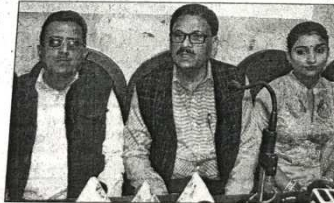
नार्थ ईस्ट कल्चर एक्सचेंज प्रोग्राम की जानकारी देते नेहरू युवा केंद्र के पदाधिकारी।