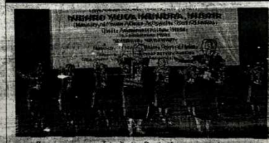
उत्तर पूर्वी युवा आदान प्रदान कार्यक्रम में सांस्कृतिक कार्यक्रम प्रस्तुत करते हुए।