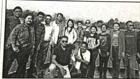
Activists of NYK Jammu posing for group photograph in Jammu.

got on the spot knowledge about war barriers who laid their life for freedom. After taking lunch at Youth Hostel Nagrota, all proceeded to Surinsar to see lake view where they spread flour to