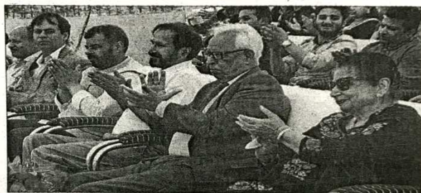
Governor NN Vohra and First Lady Usha Vohra at a cultural presentation in Raj Bhawan on Wednesday.

The Governor and First Lady lauded the folk dances presented by the participants. The Governor suggested that the Nehru Yuva Kendra San-