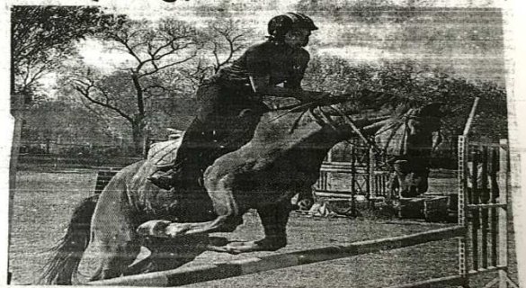
लुवास में एनसीसी कैंडेट घुड़सवारी का प्रदर्शन करते हुए।