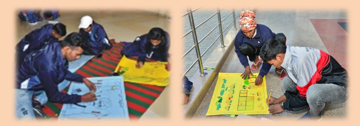
Essay and Drawing Competitions were also held during the camp for the participants. The 1^{st} , 2^{nd} and 3^{rd} Prize Winners were awarded Prizes & Certificates.

In Cultural Competition, First Prize went to Kalahadi, Odisha, whereas 2<sup>nd</sup> and 3<sup>rd</sup> Prizes were bagged by Kandmal, Odisha & Vishakhapatnam, Andhra Pradesh respectively.