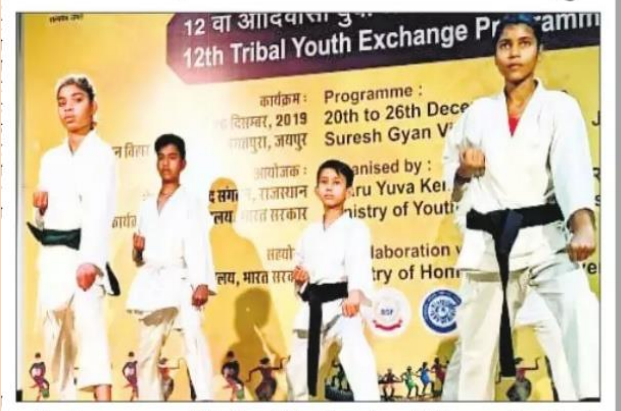
आदिवासी यवा आदान-प्रदान शिविर में बच्चों को मार्शल आर्ट व कराटे जैसे आत्मरक्षा के गर सिखाये।

संगठन, राजस्थान की ओर से जयपुर क्षेत्रों के युवा भाग ले रहे है। शिविर के उपयोगी जानकारी प्राप्त की। के सुरेश ज्ञान विहार विश्व विद्यालय में दौरान विषय विशेषज्ञों ने कौशल