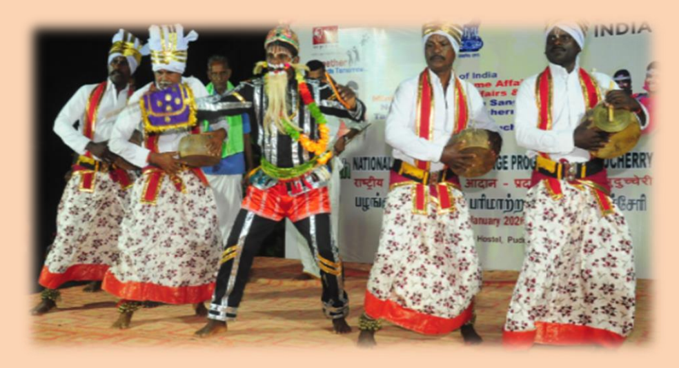
The winners of cultural competition were given prizes.