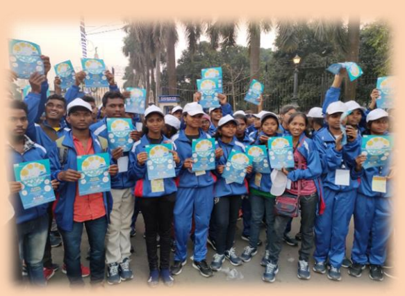
Tribal Youth were taken to world renowned sights/places like the Victoria Memorial and Biral Industrial and Technological Museumm, Vivek Mela in Kolkata.