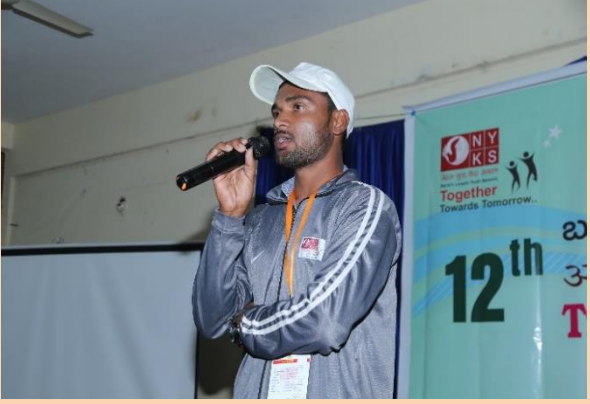
A Padyatra was organised in Cubbon Park Area on "Communal Unity/Voluntary Community Service" followed by Shramdaan and cleanliness drive.