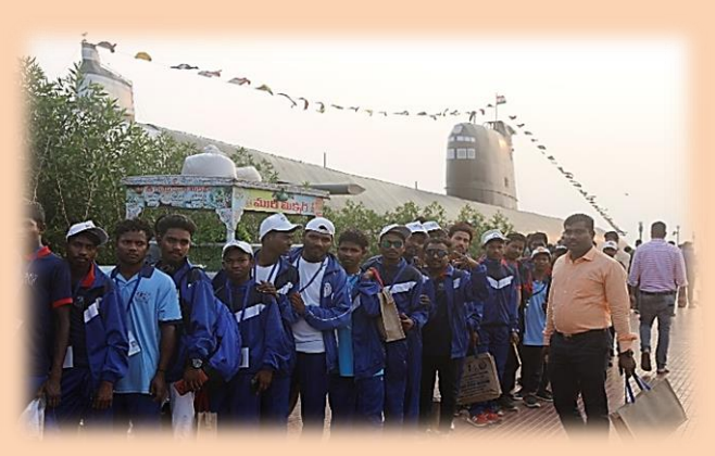
Besides, Tribal Youth were taken to historical places such as Kaialasagiri Hill Park, T124 Air Craft Museum, Kurusura Sub marine Museum and Vishakhapatnam Steel Plant.