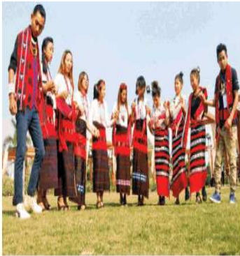
युवा आदान-प्रदान कार्यक्रम में पहुंचे नागालैंड के युवा लोकनृत्य करते हुए।

नेहरू युवा केन्द्र संगठन युवा कार्यक्रम एवं खेल मंत्रालय व गृह मंत्रालय भारत सरकार के संयुक्त तत्वावधान में उत्तर-पूर्व युवा आदान-प्रदान कार्यक्रम का आयोजन पीएस क्लब गैंगल महादेव घाट रायपुर में किया जा रहा है। इसके तहत नाथ-ईस्ट के सात राज्यों के 219 युवा रायपुर पहुंचे हैं। ये युवा छह दिनों में एक-दूसरे राज्य के साथ छत्तीसगढ़ की भाषा, संस्कृति और खानपान को समझेंगे। नाथ-ईस्ट के जितने भी राज्य हैं सभी राज्य की अपनी भाषा-संस्कृति है। इसमें नागालैंड की संस्कृति, खानपान का अपना महत्व है। उसका पहनावे से लेकर खानपान अन्य राज्यों से बहुत अलग है। लड़कों के पहनावे में सबसे महत्वपूर्ण गले में शेर के दांत व मोती की माला व