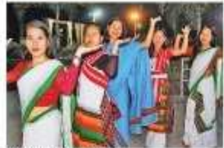
जुने दाते का-बसु ने जुने दाते का-बसु।