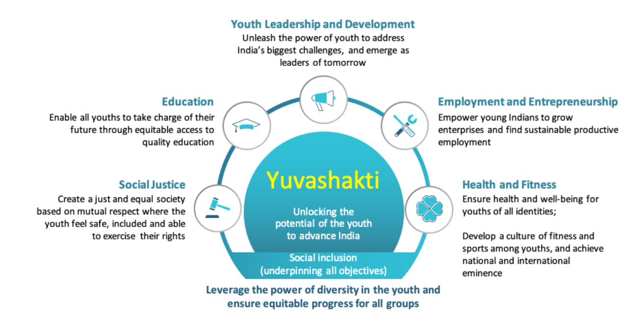
Exhibit 2: Vision and objectives of NYP 2021